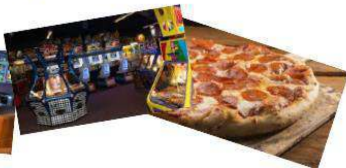
Savannah Strike Zone Bowling Hand-tossed pizza