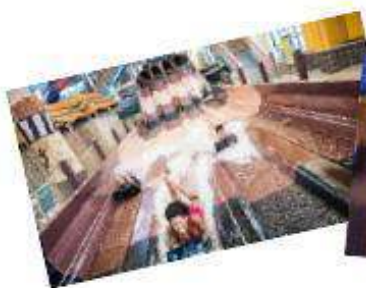
America's largest indoor waterpark "Big game" Room

For reservations, call: 1-877-525-2427 or visit our website: https://book.passkey.com/event/49829870/owner/49785631/home